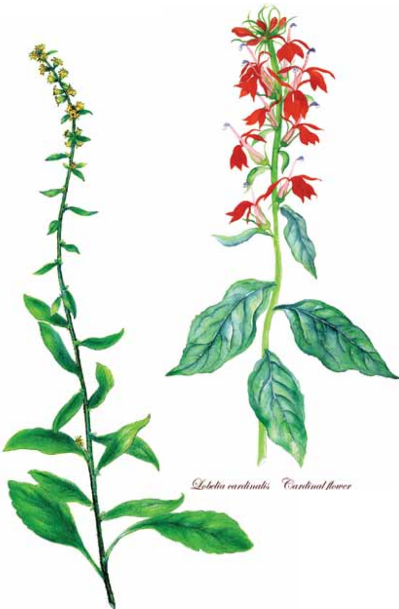
Lobelia cardinalis Cardinal flower