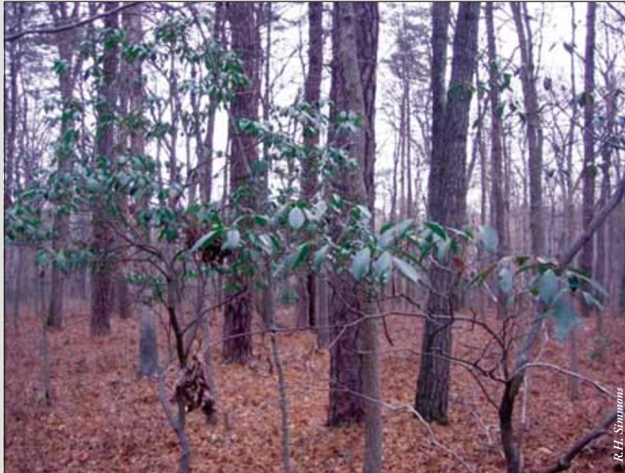
Mountain Laurel in old-age woodland, a globally rare Pine Barrens community, Beltsville Agricultural Research Center near the headwaters of Beaverdam Creek, Prince George’s Co.

Regarding wildlife, Alonso reports: “Although not a high value wildlife plant, small birds such as chickadees and titmice pick through it, especially in winter, to get scale insect eggs. The seeds are eaten by several other birds (although the seed capsules contain tiny, dust-like seeds, each can hold over 500 seeds) and white-tail deer can eat small amounts of the plant also, although that often means desperation food and over population issues. It serves best as cover, especially in winter due to its evergreen nature, and several bird species have been known to nest in it too. You rarely find a plant that doesn’t show evidence of either scale insects under the leaves or leaf stippling by rhododendron lace bugs. Stems often are scarred from azalea longhorn stem borer beetles too.”