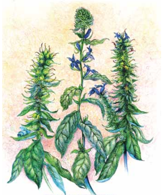
Blue Lobelia Lobelia siphilitica Campanulaceae