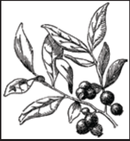
Year of the Heath