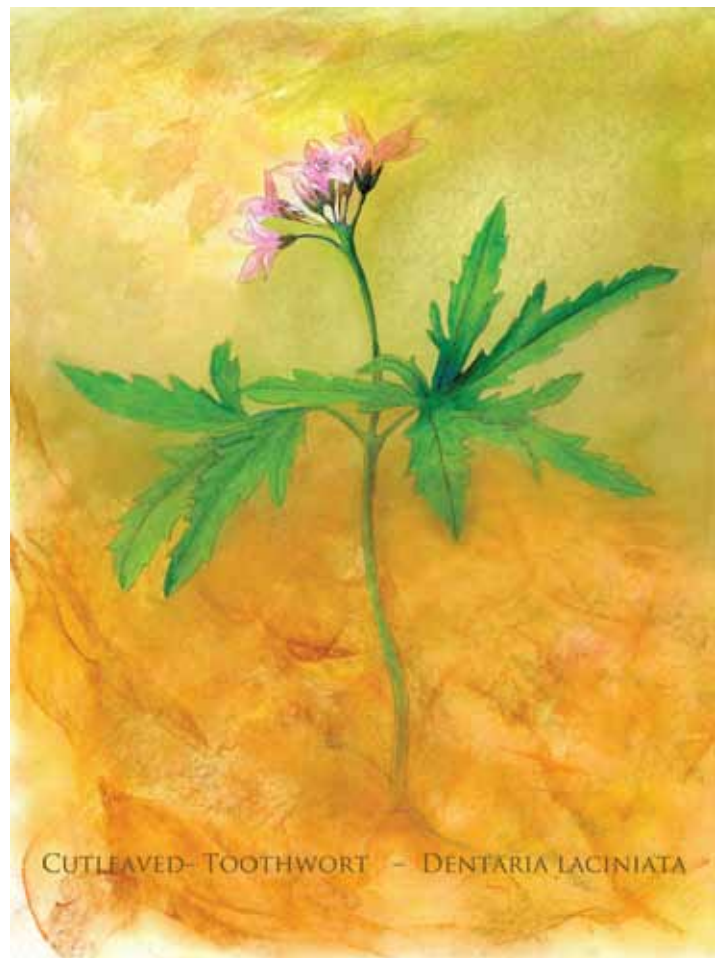
CUTLEAVED-TOOTHWORT - DENTARIA LACINIATA