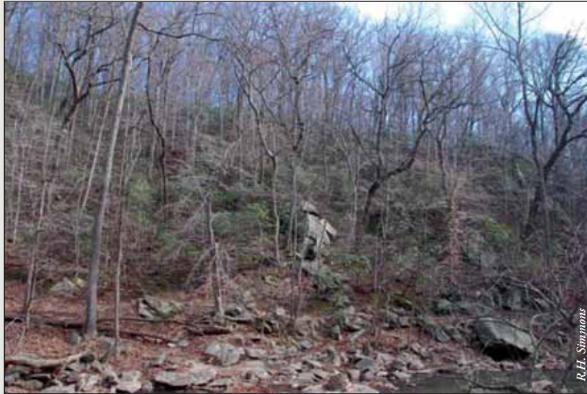
Central Appalachian/Northern Piedmont Low-Elevation Chestnut Oak Forest on rugged, north-facing slope above Rock Creek in Rock Creek Park, Washington, D.C.