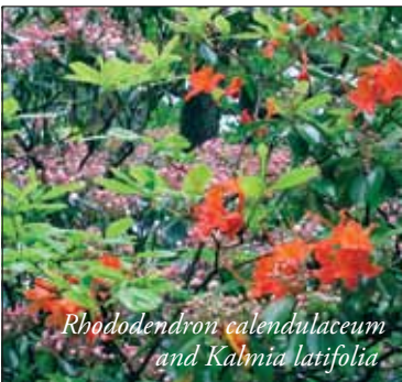
Rhododendron calendulaceum and Kalmia latifolia