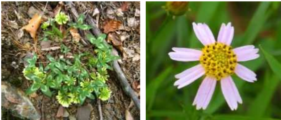
Figure 9. Two species found in regionally endemic plant communities. (left) Rare and threatened Kate's-mountain clover, Trifolium virginicum , endemic to shale barrens. (right) Rare and endangered Rose coreopsis, Coreopsis rosea , known from two Delmarva Bays on the Eastern Shore, endemic to Bay wetlands.

At the other extreme, Maryland contains part of the biodiversity zone known as the Mid-Appalachian Shale Barrens. These extremely dry and sun-baked barrens and woodlands contain 18 species found nowhere outside of the narrow Appalachian range from southwestern Pennsylvania, Maryland, western Virginia and adjacent West Virginia (Keener 1983). The flagship species of the shale barrens is a native clover called Kate's-mountain clover ( Trifolium virginicum ) (Figure 9). Maryland contains almost 100 populations of this species in a narrow ~18 kilometer-wide zone in Allegany and Washington Counties. The plants that live in these harsh habitats are obligate sun-lovers and are intolerant of shade. Kate's-mountain clover grows in exposed beds of shale with little to no soil development. Other species endemic to the shale barrens are the aptly-named shale barren goldenrod ( Solidago harrissii ), shale barren ragwort ( Packera antennariifolia ) and shale barren primrose ( Oenothera argillicola ). In the stream