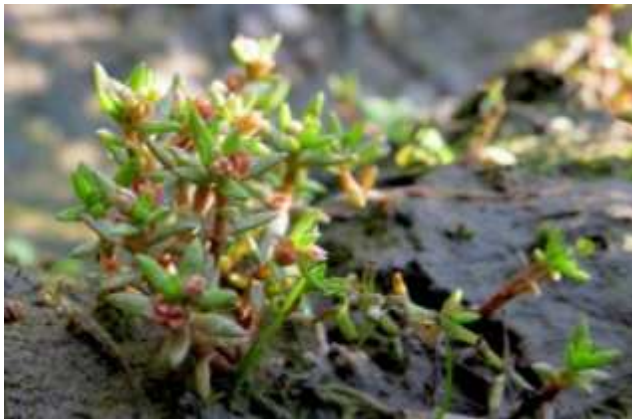
Figure 10. Water Pygmyweed (Crassula aquatica), presumed extirpated, recently rediscovered at Allen's Fresh Natural Area in Charles County, and now considered rare and endangered.

In 2011 Knapp et al. reported fifteen new native additions or rediscoveries to the flora of Maryland. In 2012 and 2013 an additional 9 species have been documented. Nearly all of these discoveries are or will be treated as rare, threatened or endangered. Among these discoveries are species in groups one would think have been thoroughly explored such as orchids and tree species. Numerous recent discoveries also mark range extensions that would also be considered noteworthy from a conservation standpoint.