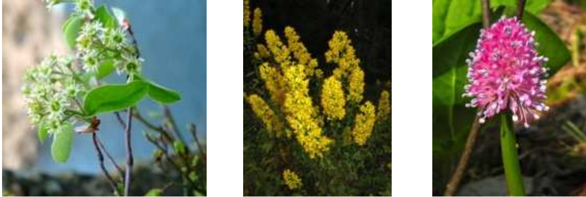
Figure 6. Three of Maryland's rare disjunct species. From left to right: Nantucket shadbush, Amelanchier nantucketensis , Photo by Christopher Frye; Showy goldenrod, Solidago speciosa , Photo by Kerry Wixted; swamp pink, Helonias bullata , Photo by Kerry Wixted.

One of the most influential climatic events on Maryland's flora was the pronounced warming period called the Hypsothermal Interval during which some midwestern plant species expanded their ranges eastward. The average temperature during this interval may have been up to 5° F warmer than today and precipitation levels may have dropped by as much as 25%. Consequently, a number of species more frequently associated with midwestern prairies now occur in Maryland in disjunct populations. An example is pale false foxglove ( Agalinis skinneriana ), which occurs in Maryland in small populations in sandy barrens of the Coastal Plain. Pettingill and Neel (2008) found that the plants occurring in Dorchester County on Maryland's Eastern Shore were genetic sisters to a population of plants from Missouri. The core range of A. skinneriana is in the central United States.