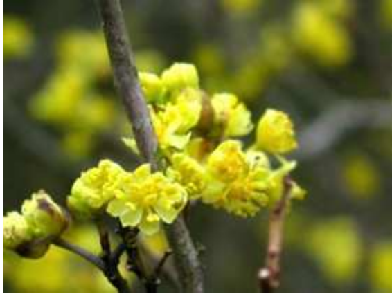
Figure 8. Pondspice, Litsea aestivalis , a rare southeastern coastal shrub is found at a single station on the Eastern Shore at its northern range limit.