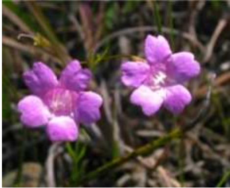
Figure 14. Rare and endangered sandplain gerardia, Agalinis acuta , is a singular disjunct species found at Soldiers Delight Natural Environmental Area. Conservation efforts have been successful, resulting in population growth.

gerardia ( Agalinis acuta ) that is the largest population in the United States. Restoration of bog turtle wetlands in the Maryland Piedmont has stabilized an otherwise declining population of Canada burnet ( Sanguisorba canadensis ). Woody plant management at an inland sand ridge site has resulted in the State's largest population of sundial lupine ( Lupinus perennis ) as well as the largest, most viable population of a globally rare butterfly, the Frosted Elfin ( Calophrys irus ), an obligate associate of lupine (host plant).