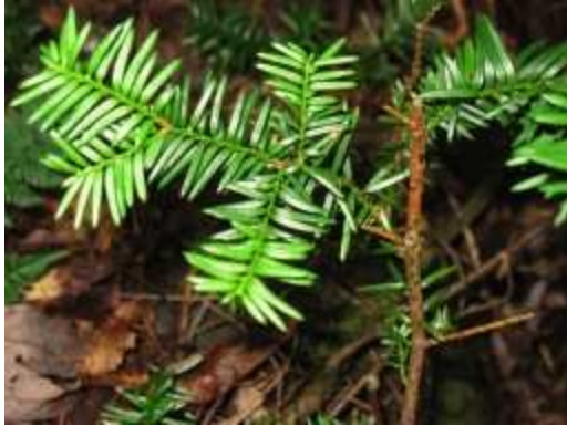
Figure 7. Canada yew, Taxus canadensis , a rare and threatened peripheral species that currently exists only in locations inaccessible to white-tailed deer.