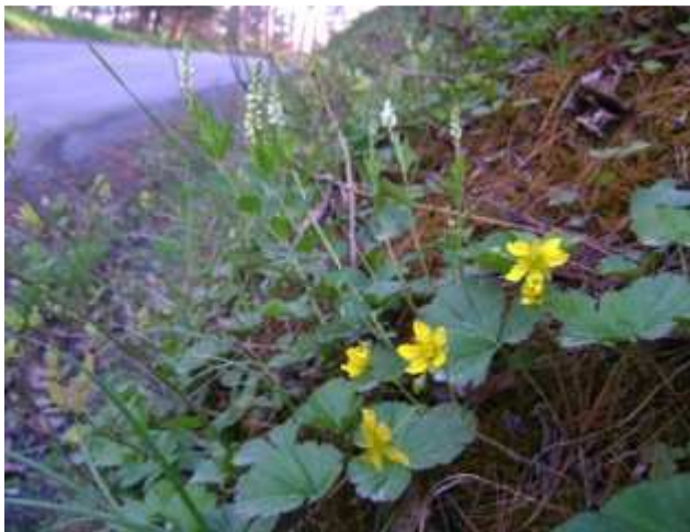
Figure 11. Barrens Strawberry, Waldstenia fragarioides (foreground, yellow flowers) growing with rare and threatened Senega Snakeroot, Polygala senega (background, white flowers) in Green Ridge State Forest, Allegany County.

In some cases, the Wildlife and Heritage Service may work with other agencies within DNR, with private organizations, or with other federal funding sources to purchase properties supporting natural communities, restore natural communities that support rare plants and animals, or to fund other projects involving both rare plants and animals. By focusing energies on those plants, animals and natural areas that are most in danger of disappearing, the Service attempts to ensure that these essential elements of Maryland's diverse biological heritage do not vanish from our landscape.