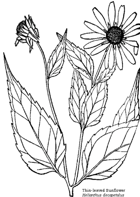
Thin-leaved Sunflower Helianthus decapetalus