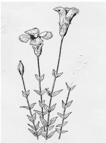
Gentianopsis crinita (Fringed Gentian)

Directions: Exit the Washington Beltway at New Hampshire Avenue (exit 28). Go north about 2 miles. The library is the first building on the right, once you have passed under Route 29, just after the Sears store.