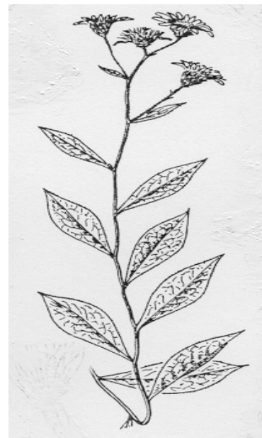
Aster infirmus (Cornel-leaved Aster)

Look for your native holidays tree order form in the next (November/December) issue of Native News !