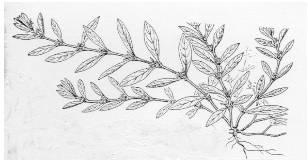
Diodia virginiana (Buttonweed)

Dates: Saturday, October 12-Sunday, October 13 For conference registration and field trip information, please read the enclosed conference brochure (if you received this in the mail) or visit the MNPS web site ( www.mdflora.org ). The web site contains more detailed information and a printable registration form. Thank you!