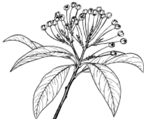
Mountain Laurel ( Kalmia latifolia )

Contact: Rod cecropia13@msn.com or 301-809-0139.