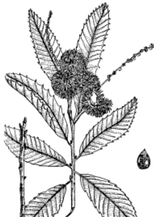
Chinquapin ( Castanea pumila )