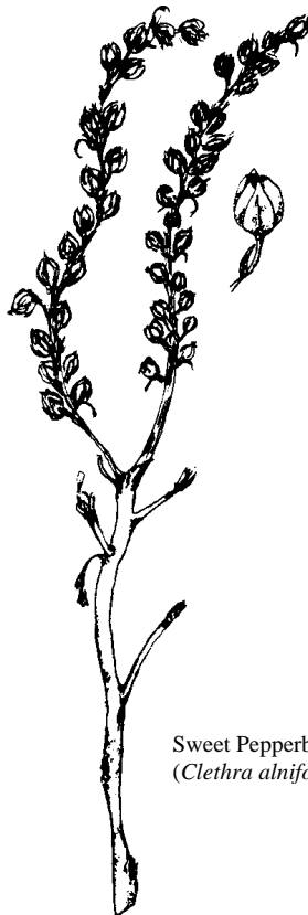
Sweet Pepperbush ( Clethra alnifolia )