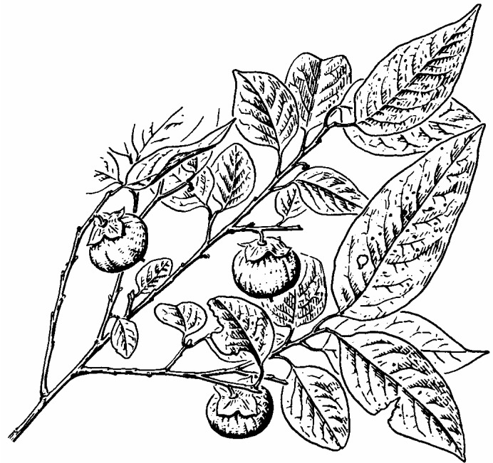
Persimmon Diospyros virginiana