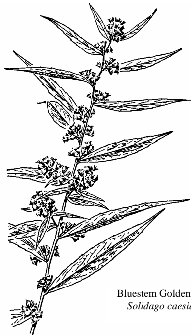
Bluestem Goldenrod Solidago caesia

Contact: Please RSVP to Joe at 410-775-7737 or Nancy at 301-416-0492 by September 7 for directions.