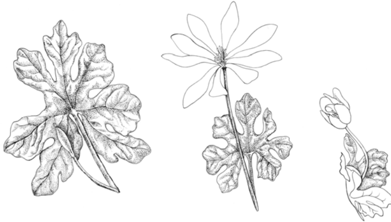
SANGUINARIA CANADENSIS • BLOODROOT