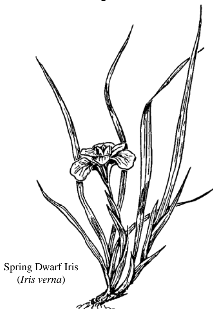
Spring Dwarf Iris ( Iris verna )

Directions: Exit the Washington Beltway at New Hampshire Ave (exit 28). Go north about 2 miles. The library is the first building on the right, once you have passed under Route 29, just after the Sears store.