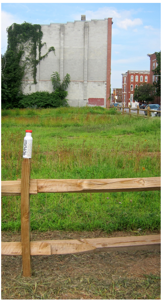
West Baltimore is an area with many vacant buildings and lots.

The photos below were taken during a July visit to the experimental sites.