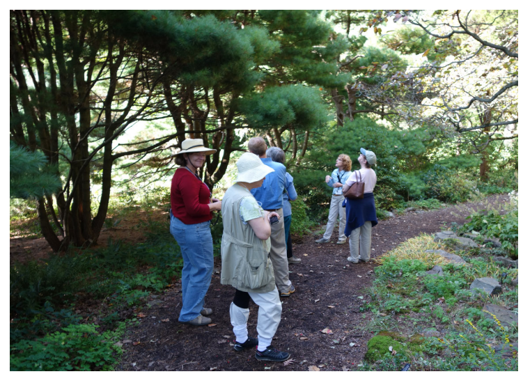
Conference Field Trip to Mt Cuba Center.