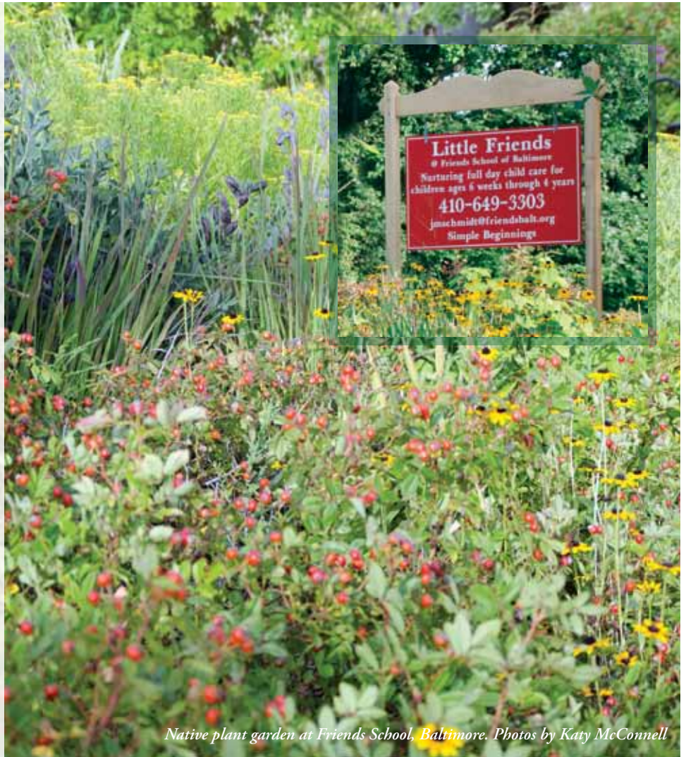
Native plant garden at Friends School, Baltimore.