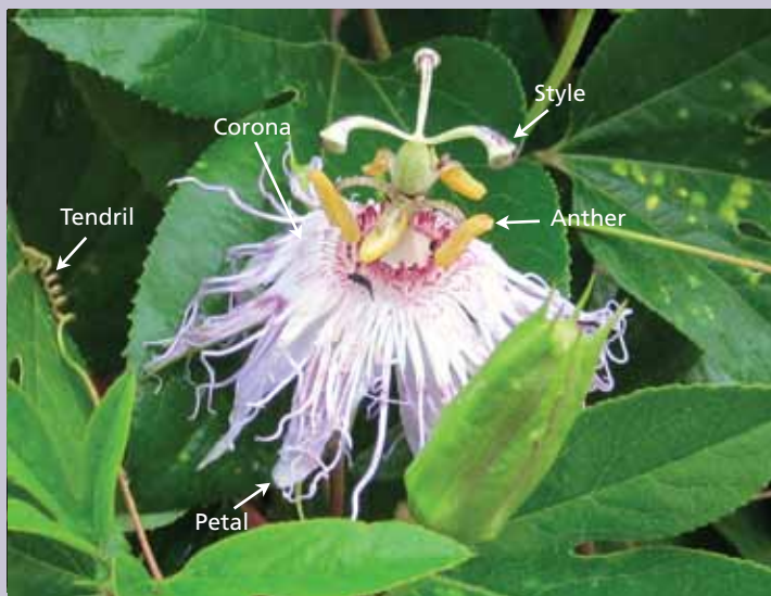
Passiflora incarnata L. ( P. lutea is on the cover).

Climbing plants often have other characteristics, which most of us are familiar with, once we stop to think: flexibility and tensile strength; rapid growth in response to contact with a structure; and delay in enlargement of leaves until the stem wraps around a support.