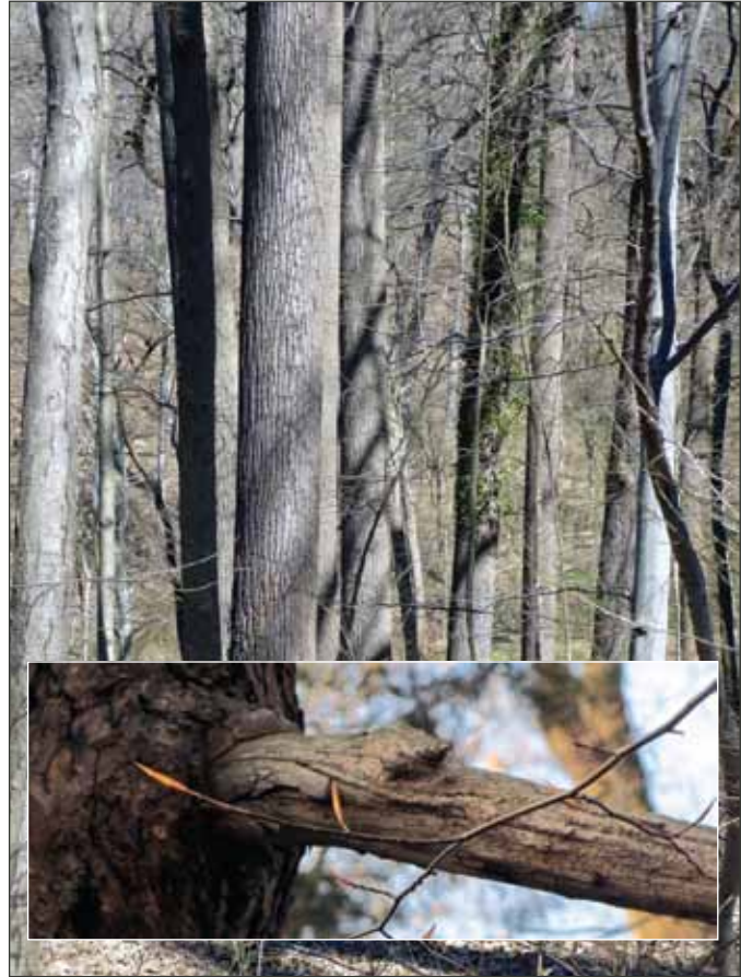
Comparison of two mature forest stands in eastern North America, one with healthy lichen diversity, cover and abundance (right: Craggy Mountains, NC.) and one where lichen diversity has been lost and degraded as a result of human influences on the environment (left, Fairmount Park, Philadelphia, PA.)