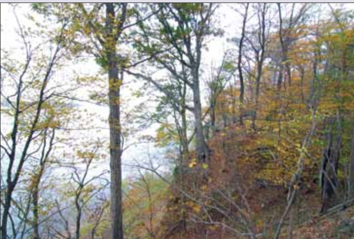
Rugged, calcareous forest along the Potomac River bluffs at Chapman State Park. This exceptional site preserves a diversity of globally-rare natural communities and rare species 20 miles south of the Nation's Capital.

As to the "hope" part of this diatribe, I would suggest a "dance with the one that brought you" regimen where natural land restoration is concerned: simply use the common, native successional plants of the appropriate local region, whether for green roof projects, highway medians, parking lots, infill development, whatever. Another method more closely aligned with nature is to refrain from planting and allow the existing native seedbank to re-emerge and naturally revegetate a site (with an accompanying non-native invasive plant removal program). This is what nature has always done with tough, disturbed sites and bare ground, and we sure have produced a ghastly legacy of land-use disturbance over the years. Nonetheless, the outgrowth of these naturally healed lands, as well as the tens of thousands of acres of remarkable, remnant wild areas in and around most cities, are what most of us have grown up with and love and appreciate, mainly because they are real and natural!