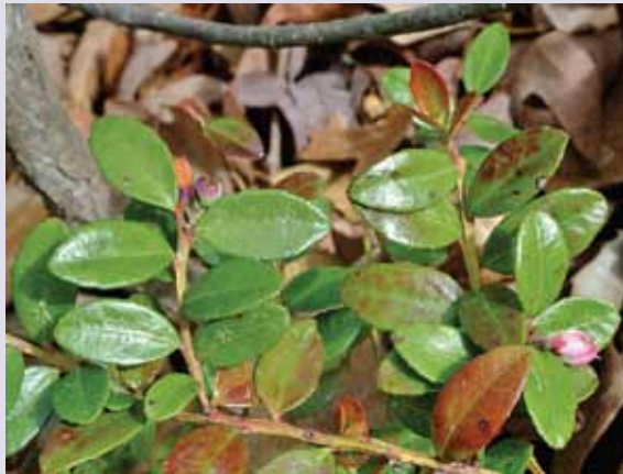
Naturally occurring Box Huckleberry (Gaylussacia brachycera) at Nanticoke State Wildlife Area, Delaware.