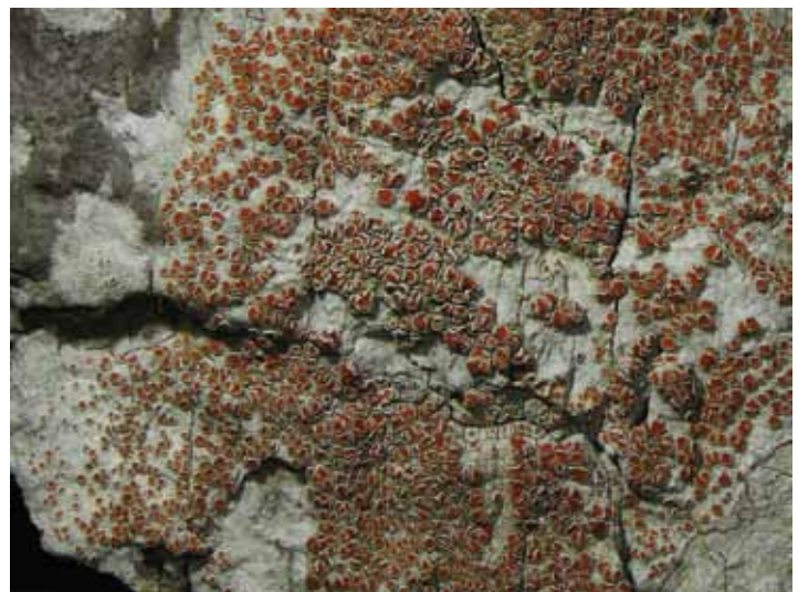
Haematomma persoonii , a subtropical crustose lichen whose northern distributional limit is found in eastern Maryland.