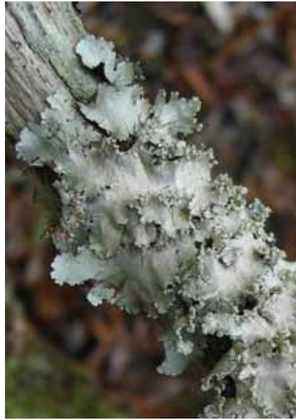
Parmotrema hypoleucinum , a common foliose lichen in eastern Maryland.

But let's take a step back. What are lichens? Lichens are species of fungi that have evolved a unique lifestyle wherein they form a symbiosis with a species of algae or cyanobacteria. When we talk about lichen species we are referring to species of fungi, not the algae or cyanobacteria, which belong to other domains of life and have their own names. Nor are we referring to the symbiosis itself (i.e., the collaboration formed by the fungus and the algae) because across the range of a lichen species the same fungal species can associate with different types of algae or cyanobacteria. The thallus, or body, of the lichen is a collaborative effort that looks nothing like the individual parts of the symbiosis. If