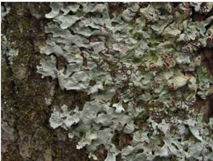
Lobaria quercizans , a macrolichen that is now rare in Maryland and restricted to mature forests.

Across Maryland, from the highest mountains to the eastern shore, there are hundreds of lichens performing critical tasks for our ecosystems and for us. At least there should be. Lichens are highly sensitive to pollution and environmental degradation. Thus, after centuries of human changes to the natural landscape there are now evident declines in many lichen species, even regional extinctions. The lichens we see today are a small remnant of what once was. (The comparison photo depicts the visible impact of lichen loss in eastern forests.) Sadly, recent research shows that rising sea levels are likely to inundate the major lichen biodiversity hotspot of the Atlantic Coastal Plain. That means the loss of the last place in the Mid-Atlantic where one can see the lichens as (continued on facing page)